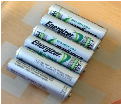
Standard batteries with the protruding positive terminals