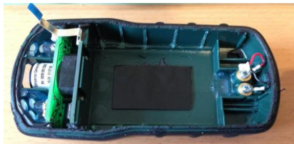
The camera body that had to be modified for standard rechargeable batteries

“Brian you’re a radio ham what do you know about rechargeable batteries?”