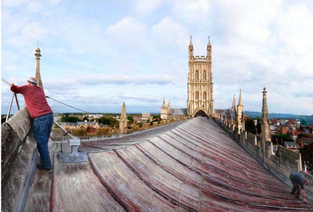
Fiddler on the roof or Alan G4MGW