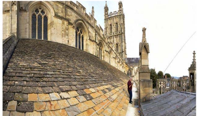
Lowering the coax down from the roof